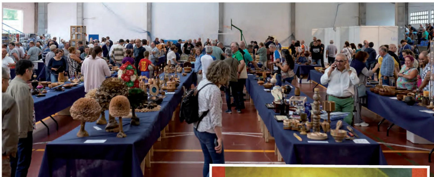
PHOTOGRAPHS COURTESY OF JOSE ANGEL RAMIL UNLESS OTHERWISE INDICATED