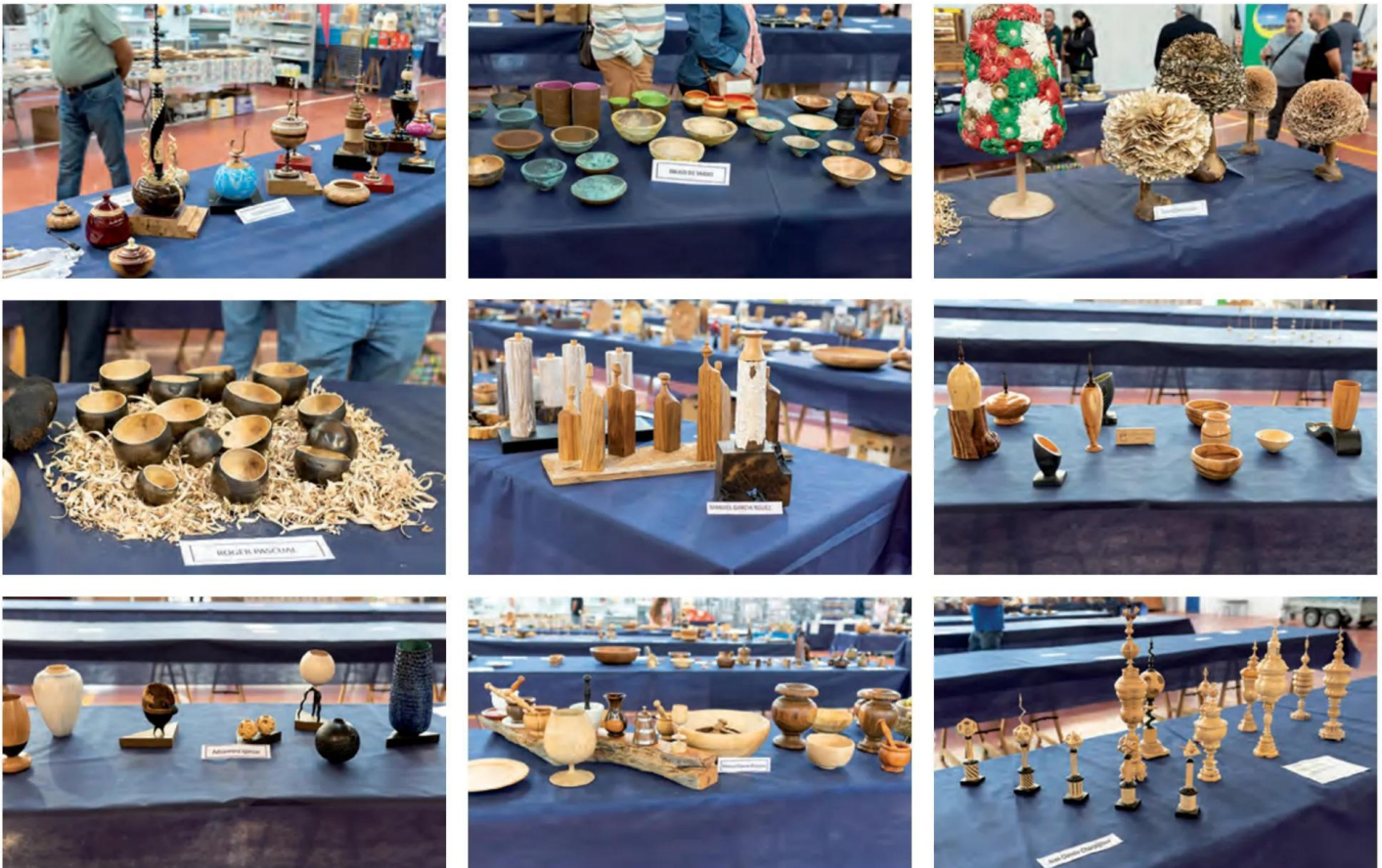
Above: Examples of work on display

be of the highest quality against other pieces are selected. I like that the event is designed to encourage people to improve their skills; knowing that a piece of your work will be on display for the year is a great incentive to continue to develop your technical and artistic understanding of woodturning.