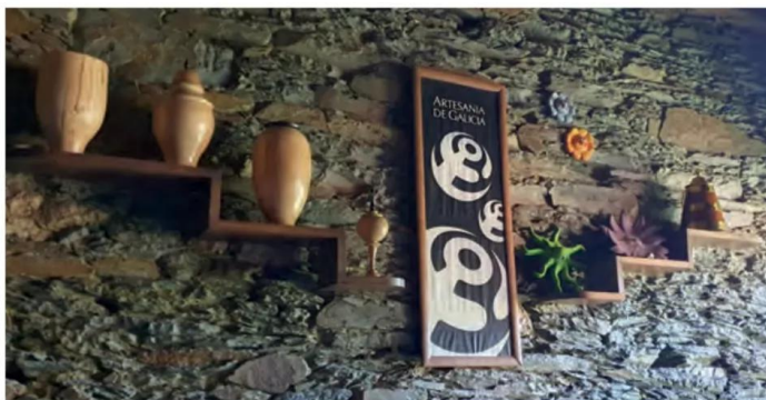
A Fraga Aldea Artesán